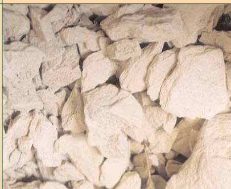
left: Out of doors with Sherry and tapas above right: The solera system below right: White calcareous marl soil gives Sherry its unique character

dry, delicately floral and tangy aroma. Unlike the two others, Amontillados are then fortified with further alcohol after the yeast stage in order to – like Olorosos – continue aging without yeast, directly influenced by ambient air. Were it not for the yeast, Sherry enthusiasts would have fewer varieties to choose from. In actual fact, these yeast cultures only thrive in coastal areas. As they near the dry inland, they become weaker and eventually disappear completely.